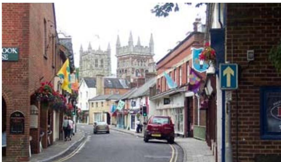
Wimborne