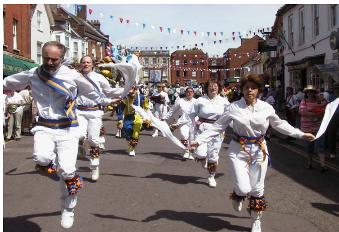
Wimborne Festival

Wimborne is a lovely market town, and is fully geared up for Folk Campers: