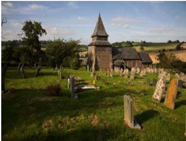
St John the Baptist church, Orcop

Orcop offers a tranquil and peaceful setting with plenty of space, and hopefully quieter sheep than of recent years.