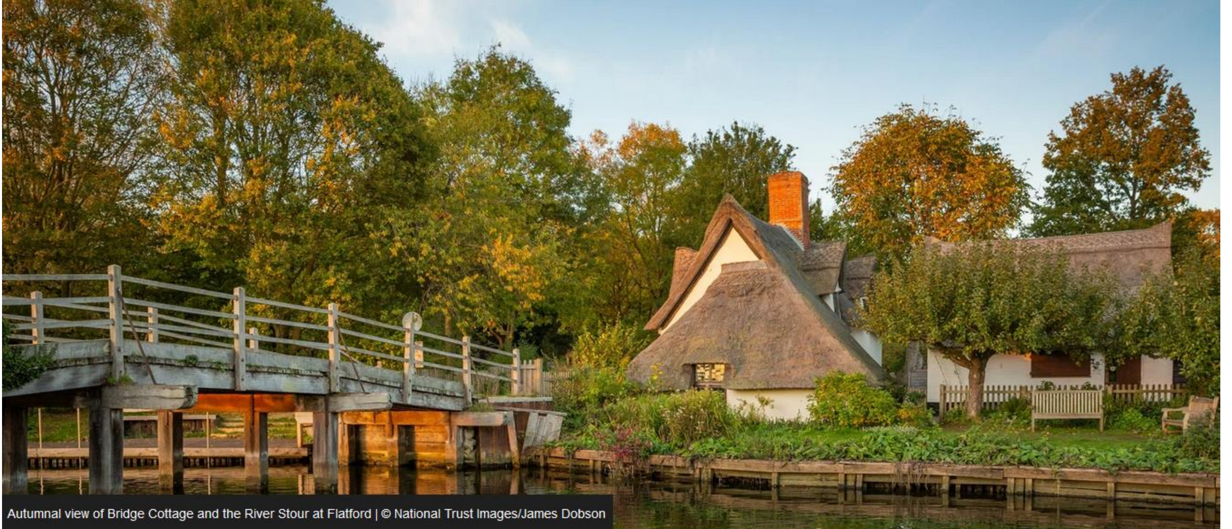
Autumnal view of Bridge Cottage and the River Stour at Flatford | © National Trust Images/James Dobson